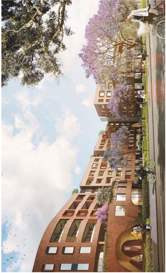
3 Huntley Street View