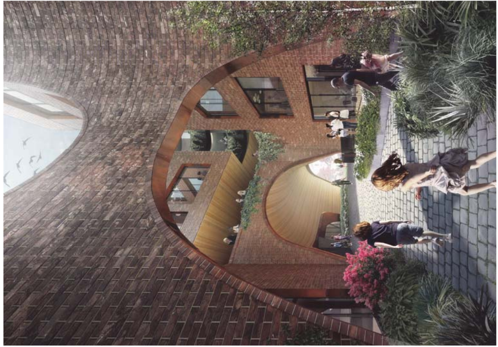
2 Eastern Through Site Link View

SMEC SMEC CONSULTANTS 200 WILSON ROAD SYDNEY NSW 2007 www.smecc.com.au mbm Quality Design Quality Construction Quality Project Management www.mbm.com.au