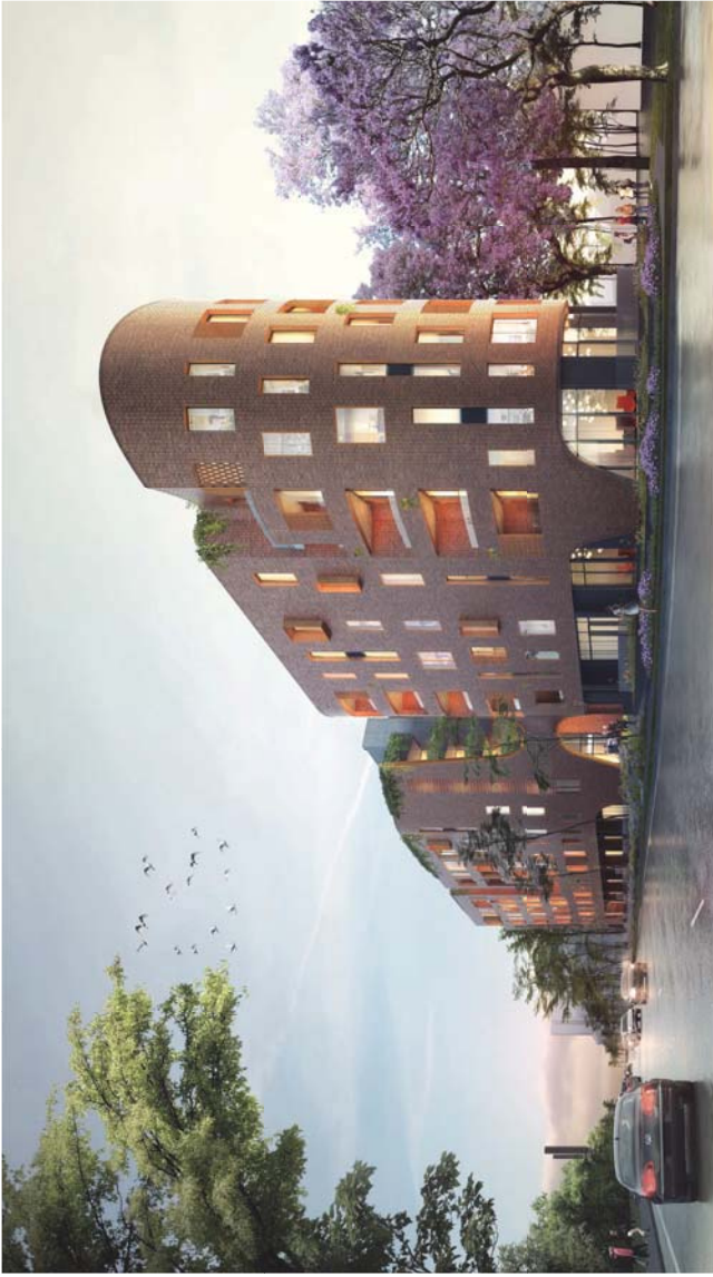
1 Sydney Park Road View